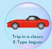
Trip in a classic E-Type Jaguar