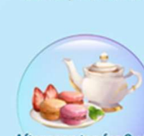
Afternoon tea for 2 at The Black Shed, Slimbridge