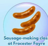
Sausage-making class at Frocester Fayre

We are still accepting offers of promises, items and experiences. So far, we have: